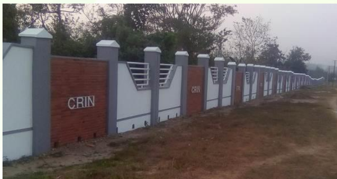
Ultramodern Perimeter Fence