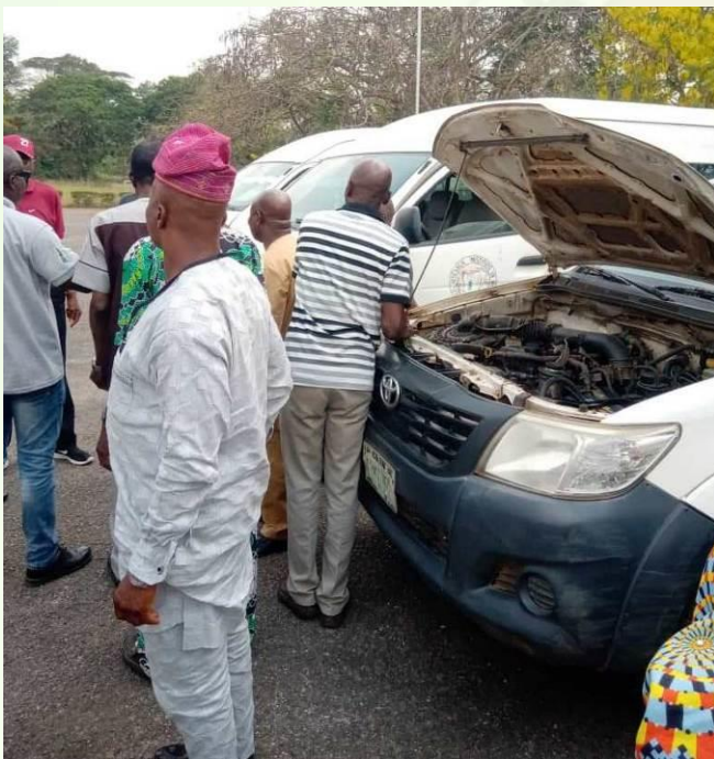
Close Inspection of the Refurbished vehicles