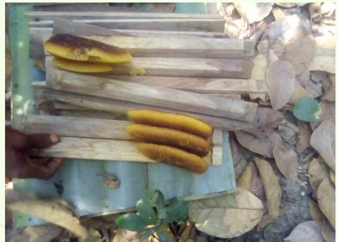
A partially colonised hive