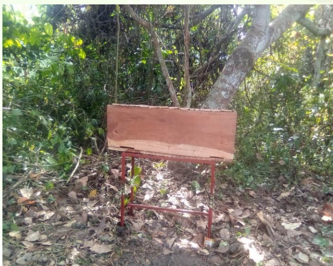
A beehive deployed on site