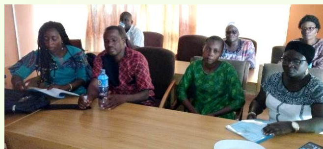
Cross section of the staff at OAU, Ile-Ife

Furthermore, seven staff of Plantation and Estate Management (PEM) Division with Store Officer were trained on leadership skills at Obafemi Awolowo University, Ile-Ife, Osun State. The course content includes: Strategic Leadership Skill and Development Planning to Save Cost; Performance Management for Organizational Efficiency; Critical Thinking Skills Development; Effective Report Writing Skills Development; and Communicating Effectively.