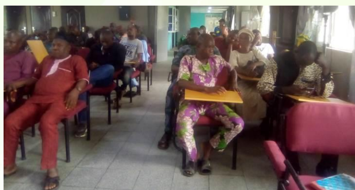
Cross section of bidders for the unserviceable items