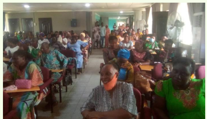
Cross section of elated audience