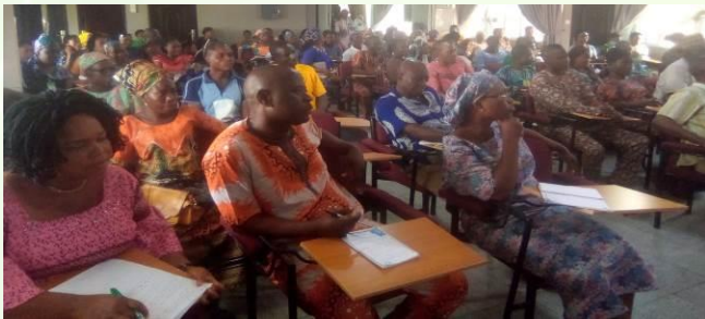
Cross section of audience at the session