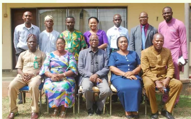
CRIN Staff with Trainer at ASCON Badagry.

The Admin staff were trained on Administrative Communication Skills” at the Administrative Staff College of Nigeria (ASCON), Topo, Badagry, Lagos.