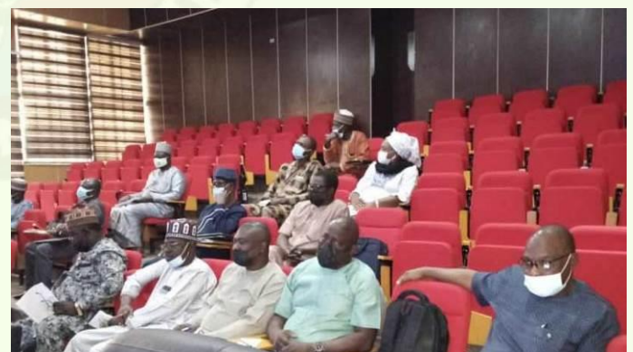
Cross section of the participants at the meeting