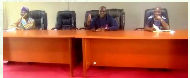
The Executive Director (middle) and the Ag. Heads of Admin (left) and Account (right)

as well as instilling decorum at the JS quarters. The ED intimated the gathering of the dogged efforts he has made towards ensuring optimal outputs from the Pure Water and Bakery Unit of the IGR Division as well as decency at the JS Quarters. The Pure Water Factory has been fully equipped and deliveries are made to the nooks and crannies of the host communities, while the Bakery would be contracted out in order to forestall previous in-house handling failures. The checkmating of the security lapses at the JS Quarters came to the fore and the ED promised to plug the holes by erecting perimeter fence at the Quarter. The visibly elated staff and business owners at the JS Quarter were full of appreciation to the ED for his show of concern over their welfare and prayed for continued success in his transformation drive of the Institute.