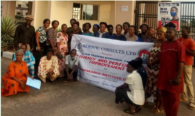
Nursery Staff trained on Efficiency and Performance Improvement at McPherson University, Ajebo, Ogun State

A MONTHLY PUBLICATION OF COCOA RESEARCH INSTITUTE OF NIGERIA (CRIN), IBADAN.