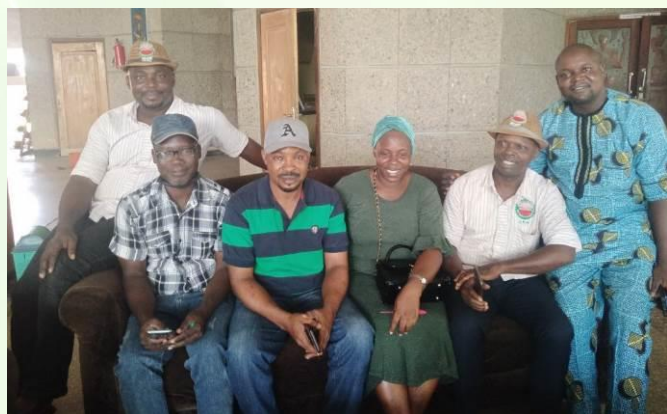
Union Executives of ASURI, SSAUTHRAI and NASU sponsored for the training at Ile-Ife

and Collective Bargaining As An Industrial Conflict Resolutions.