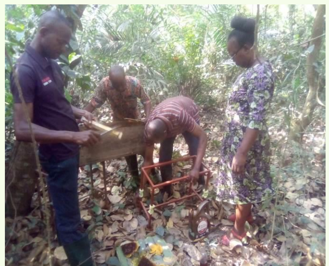
Rehabilitation of defective beehive