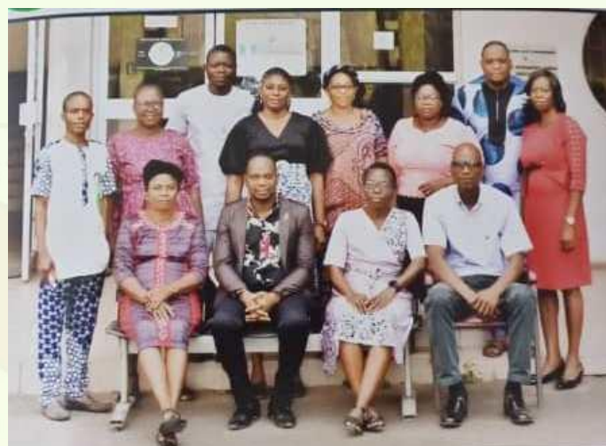
Admin and Account Staff trained on Ethics and Productivity Improvement at the Centre for Management and Development, Lagos

The Administrative Skills they were exposed to include: Human Relations and Effective Communication; Drafting, Minuting, Memo and Letter Writing; Report Writing; Servicing Meetings; Listening Skills, Handling Official Documents; and the Role of ICT in Official Communication.