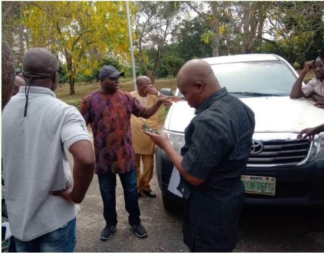
The ED inspecting the refurbished vehicles