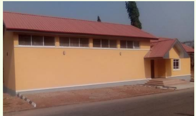
The Rebranded Cocoa Fermentary