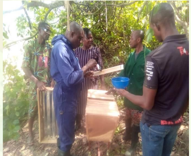
Preparation of hive with bait for bee keeping