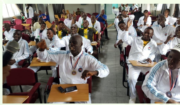
The visibly excited contingents

showered praises on the ED, the man that made it all happen.