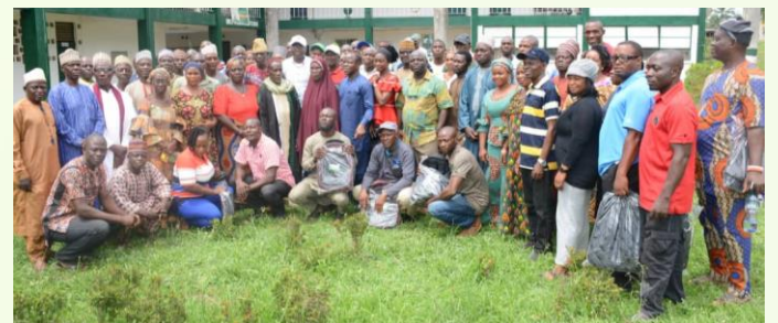
Cross section of the participants