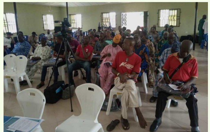
Participants at the training