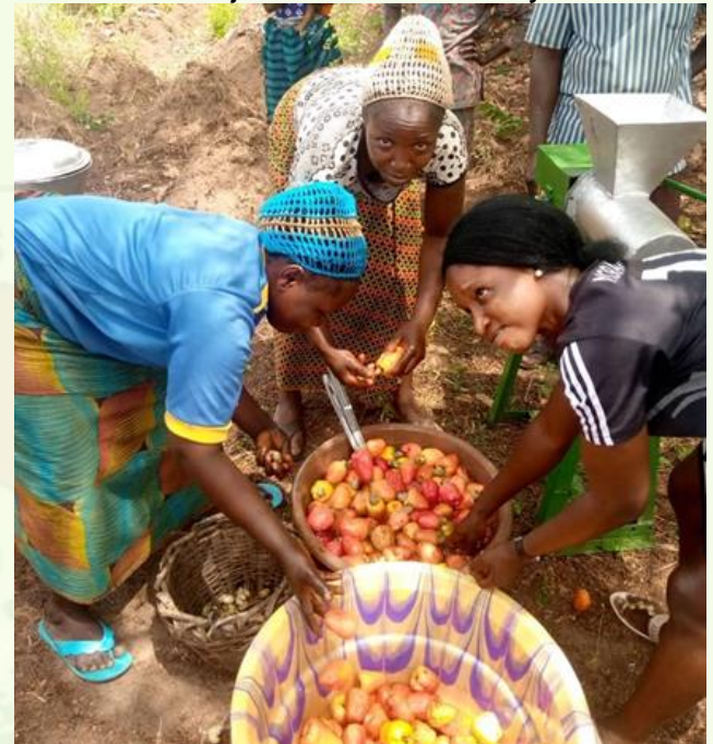
Cashew juice extraction

Itesiwaju, Ibarapa, Atisbo and Kajola, respectively. On-farm demonstration and training was also carried. Farmers were also taught on the technology for the production of cashew juice and meat from cashew bagasse and its health benefits for vegetarians. The training was also extended to cashew farmers at Irewole-Aroje in Saki area of Oyo State.