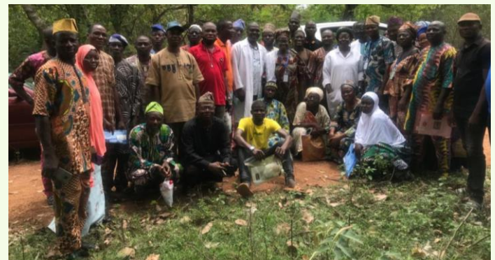
Group photograph with farmers

This training of cashew farmers on cashew juice and meat production will create various opportunities to increase farmer's income, make rural economies stronger, help in creating raw materials for industries, improve food nutrition due to Vitamin C content in cashew apple and reduction of wastages associated with cashew apples.