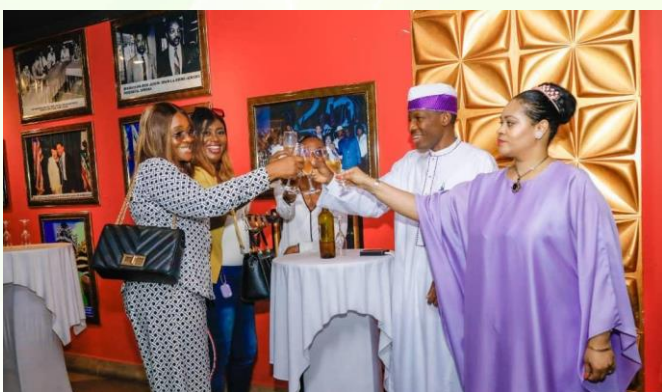
Toast with CRIN Cocoa Wine