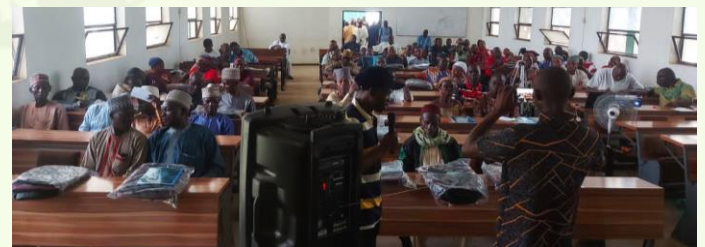
Training in session