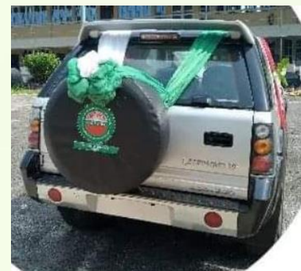
Front, side and back view of the vehicle