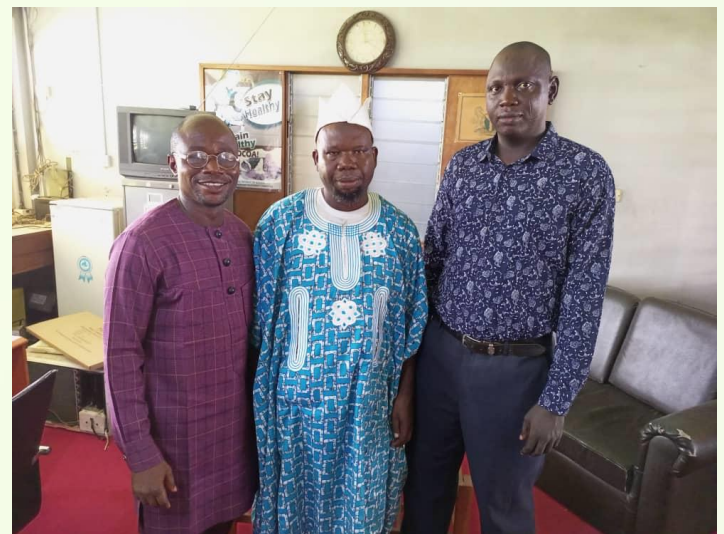
The FCA awardees

The event took place during the 20th conferment of Fellowship status ceremony which held on Wednesday 20 April, 2022 at ICAN Centre, Lake View Estate, Amuwo Odofin, Lagos State. Hearty congratulations to the awardees.