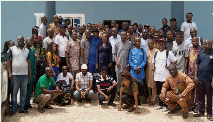
A cross section of participants with the facilitators

A MONTHLY PUBLICATION OF COCOA RESEARCH INSTITUTE OF NIGERIA (CRIN), IBADAN.