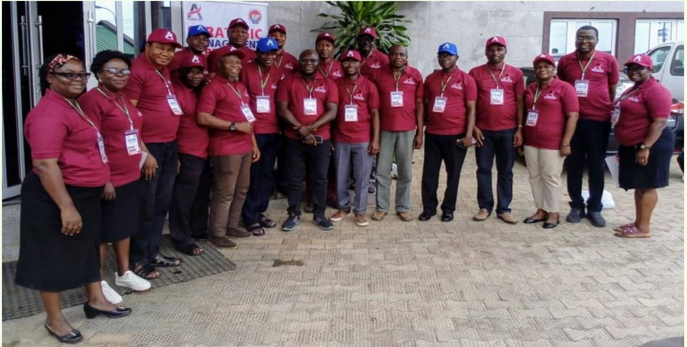
CRIN Management Team at the Strategic Management Retreat in Conference Hotel, Sagamu

strategic plan that will bring laudable development to the Institute.