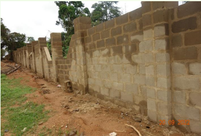
Ongoing perimeter fencing