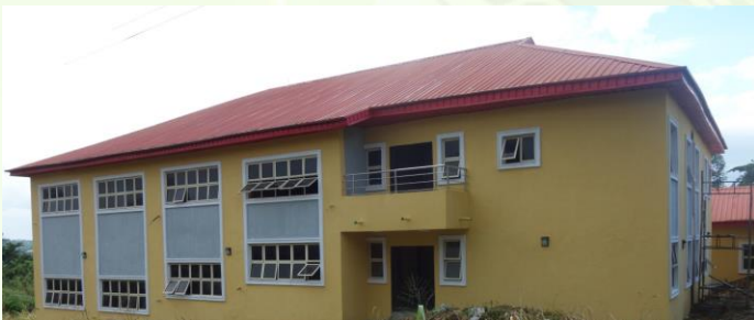
Front view of the Central Laboratory