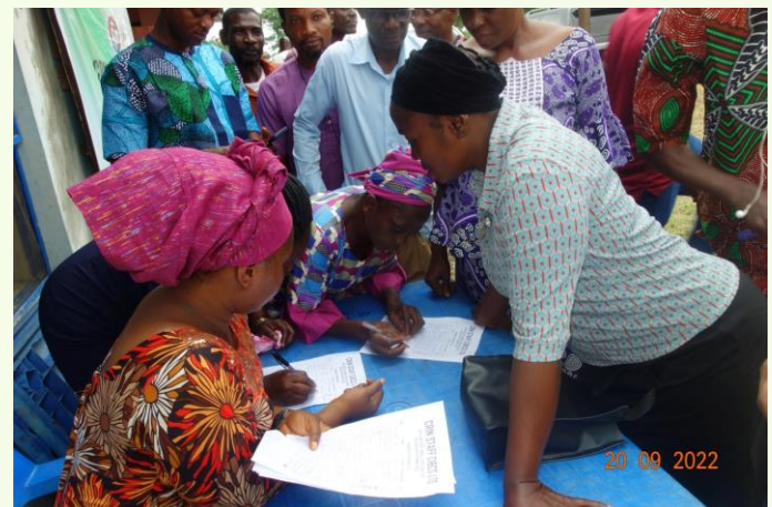
Registration of cooperators during the AGM