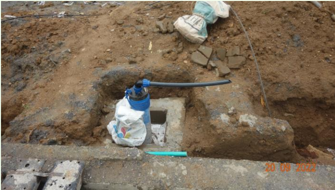
The installed borehole

A MONTHLY PUBLICATION OF COCOA RESEARCH INSTITUTE OF NIGERIA (CRIN), IBADAN.