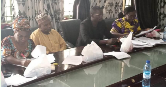
Aptitude Test Marking Session

high moral standards in exercises of this nature, because it has saved all the stakeholders from any anticipated troubles.