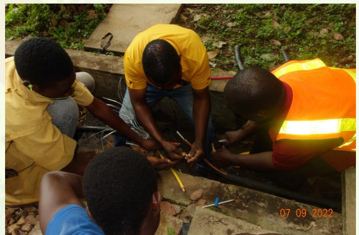
Termination of the armoured cable