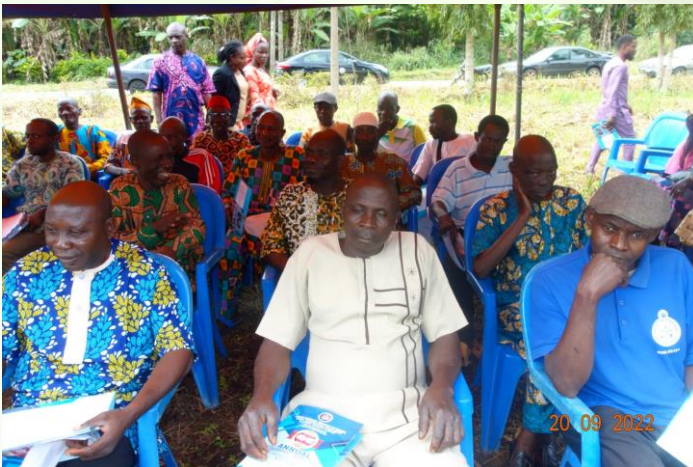
Cross-section of cooperators at the occasion