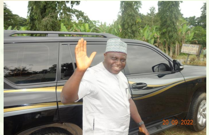
Arrival of the ED CRIN at the CICS AGM