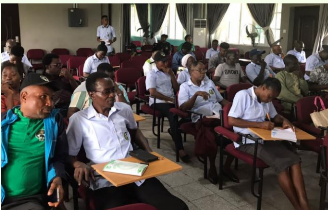
Cross section of participants