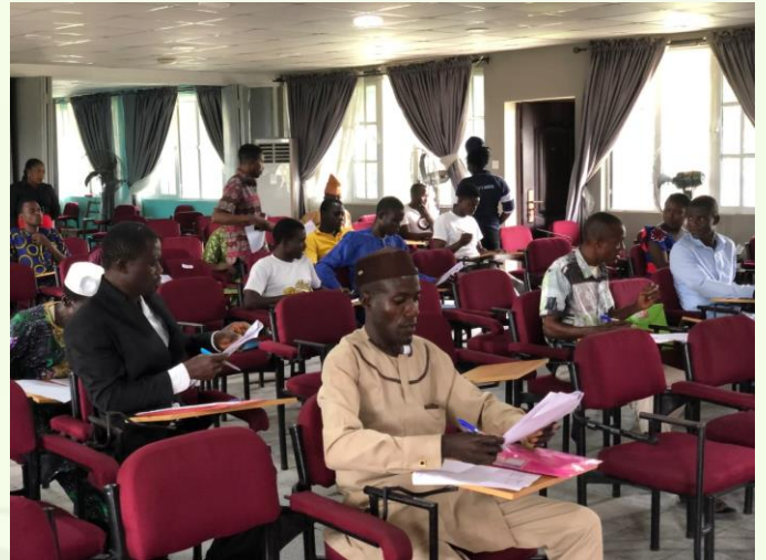
Cross section of the participants

He congratulated the candidates for their participations in the exercise. CRIN's management is committed to the progress and welfare of her staff, hence the prompt conduct of the promotion exercise. He urged the participants to give their best to assigned duties and wished them best of luck.