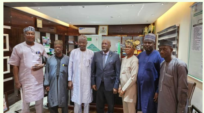
Group photograph of the appointees with the PS and ES