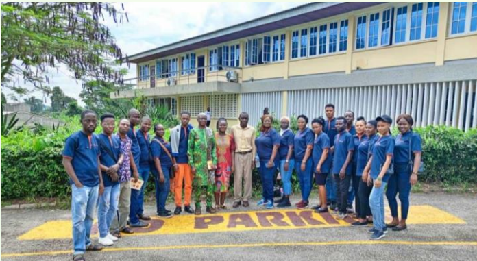
Cross section of school staff members and CRIN facilitators

A MONTHLY PUBLICATION OF COCOA RESEARCH INSTITUTE OF NIGERIA (CRIN), IBADAN.