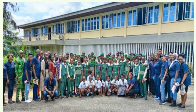
Cross sections of the students and staff