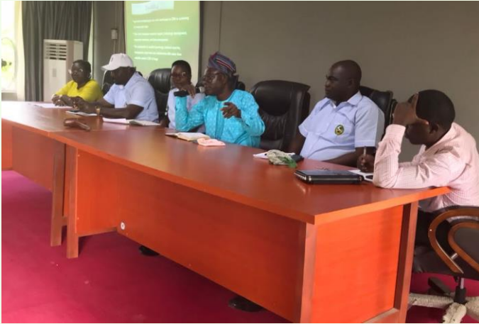
The Director, Production and Substations and members of AATON

A MONTHLY PUBLICATION OF COCOA RESEARCH INSTITUTE OF NIGERIA (CRIN), IBADAN.