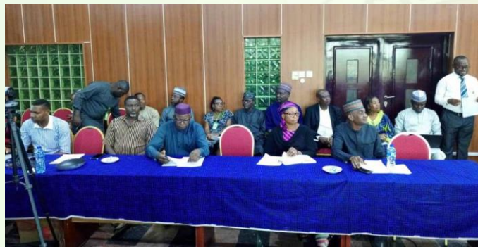
Cross section of event attendee

reorganized the sitting together of women and men in one room in some offices, which is part of what this policy tends to address. This policy also tries to see why the Council should not demarcate between a man and a woman in an office environment, because the Council do not want the gender issue to be strictly looked at as a woman thing. All the invited guests from NPC, IFPRI, and OXFAM delivered keynote addresses which was summed up by the representative of the Permanent Secretary and Head of Gender Group of the Ministry.