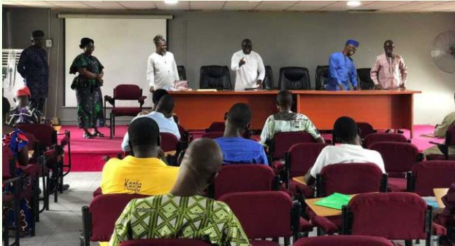
Hearty well wishes of the ED to the participants