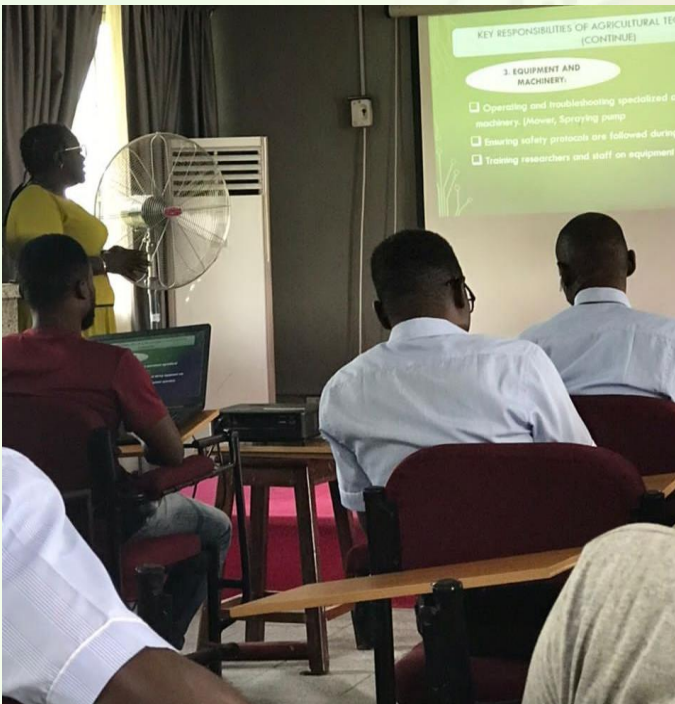
Presentation by the Plantation Manager