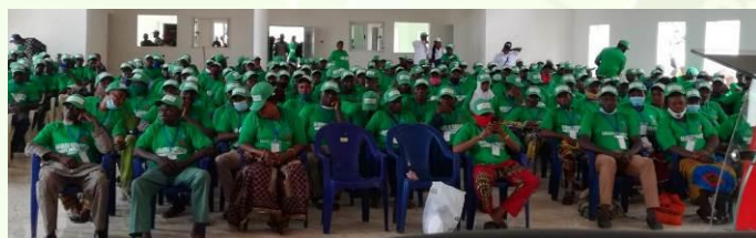
Cross section of participants from Akoko Edo and Etsako West LGAs