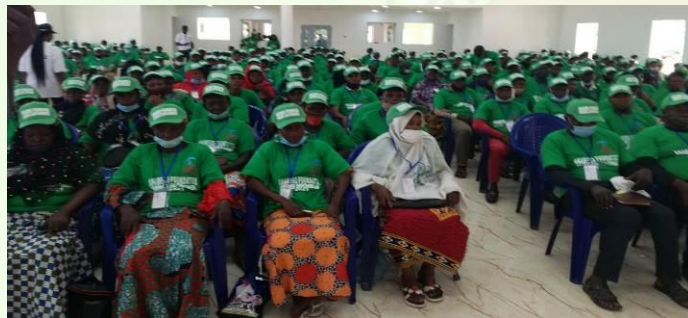
Cross section of participants from Owan West and Etsako East LGAs