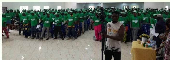
Cross section of participants from Owan East and Etsako Central LGAs