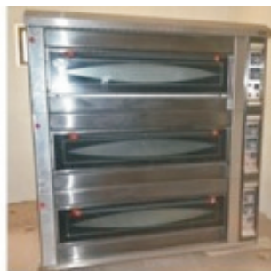
Modern Bakery Oven

Sophisticated modern equipment have been lately installed at CRIN Bakery.