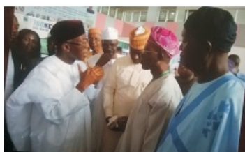
Ag. ED with the Honourable Minister of Agriculture at 42nd NCARD meeting

The above directive was given by the Honourable Minister of Agriculture