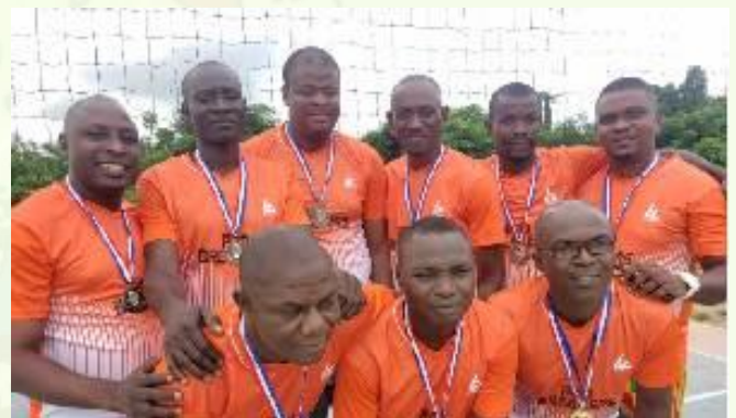
The victorious team members

The volleyball team of the Institute emerged victorious during Federal Government Parastatals and Allied Institutions Volleyball Staff Games (FEGOPAG) which was held from 20 to 25 September, 2021. The venue was Nigeria Security and Civil Defence Corps Oyo State Command Headquarters, Ibadan. The following were the Institutions that participated in the meet: Customs, Forestry Research Institute of Nigeria (FRIN), Nigerian Securities and Civil Defence Corps (NSCDC), Police, Federal College of Animal Health (FCAH), Moor Plantation and CRIN. The Cocoa Research Institute of Nigeria team walloped her opponents and clinched the third position.