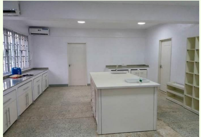
Renovated Flavour Quality Laboratory