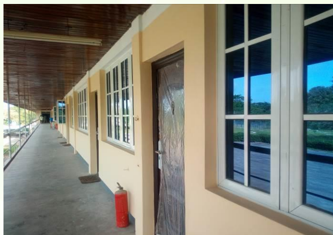
Walkway of the Renovated Directorate Block