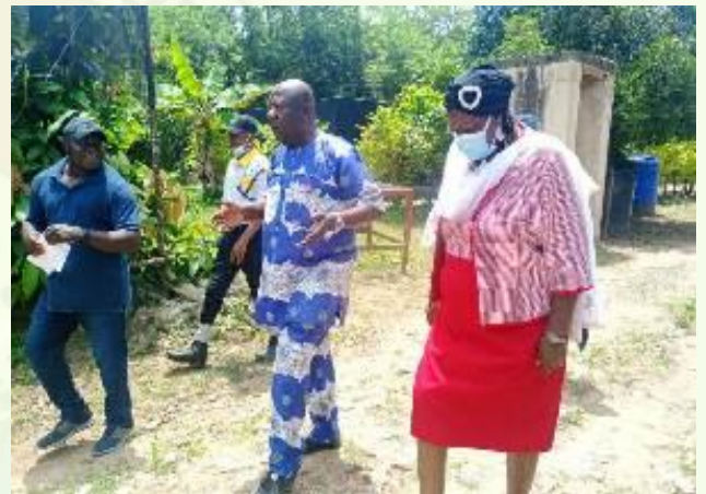
Visibly elated board members and the Executive Director (left)