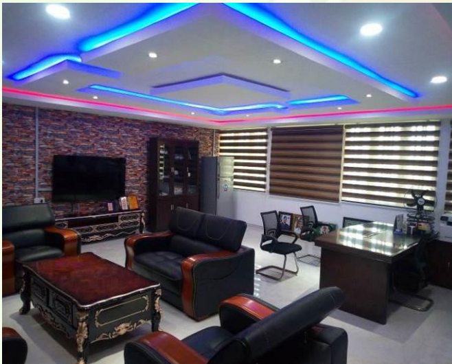
Renovated ED's Office

Additionally, the ED upgraded the Institute Website ( https://crin.gov.ng/ ) and the Internet bandwidth from 4Mbps to 100Mbps; Resuscitated the Pure Water Factory; Renovated the Flavour Quality Laboratory; Established Gymnastic Centre; On-going construction of the fermentary and the Perimeter fencing of the Institute.