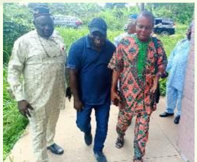
The Executive Director (middle) exchanging pleasantries with the board members