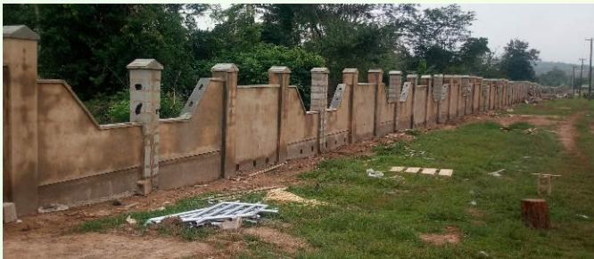
On-going perimeter fencing of the Institute

A MONTHLY PUBLICATION OF COCOA RESEARCH INSTITUTE OF NIGERIA (CRIN), IBADAN.