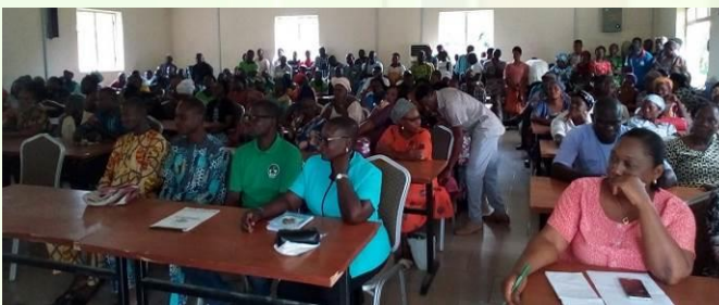
Cross Section of Staff listening with rapt attention