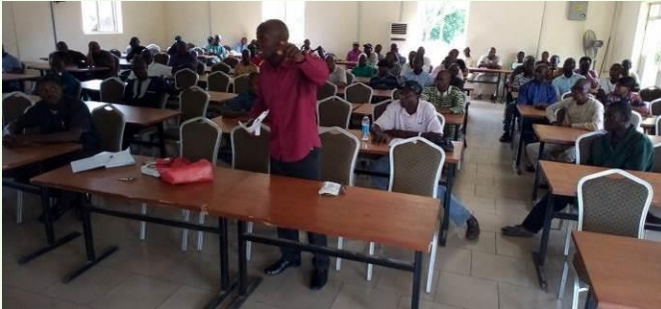
Reactions from the Engineering Department