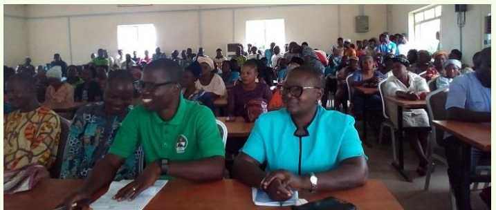
CRIN Staff from Productions and Substation Department

Furthermore, the ED CRIN intimated the staff that he has given the approval to upgrade Internet bandwidth from 4Mbps to 100Mbps as well as revamp of the Institute website. He promised to implement staff training, engage in renovations and road construction, procure furniture, computers, printers, stationeries, address paucity of office space and improve water and power supply. He implored all staff to maintain strict confidentiality, observe security consciousness, join hands to move the Institute forward and safeguard the property of the Institute. The ED CRIN solicited for more cooperation and prayers for the Institute. On the other hand, the staff applauded the untiring efforts of the Executive Director and his management committee towards the welfare of the staff. This was evidenced by the facilitation of the payment of 75% of returned salary to the affected staff among many others.