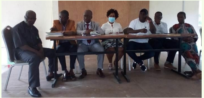
CRIN Management Committee in attendance

rubbing minds one-on-one with the staff as against bottle-necks that may be occasioned by going through intermediaries. The ED CRIN stated that he operates by open door policy to all staff so as not to take wrong steps. He emphasized “under-promise but over-perform” as his operational mantra. He implored to be guided aright. The ED CRIN openly declared that there is nothing stopping him from turning the Institute around. This was demonstrated by his fruitful drive towards addressing the skewed staff disposition. He cheered the staff with heart-warming news on securing first stage approval to employ over two hundred staff who would be mainly of junior cadre. Furthermore, the Institute pure water factory has commenced production in commercial scale and would soon engage in bottle water production under his watch. The bakery that suffered abandonment is also receiving attention from the ED.