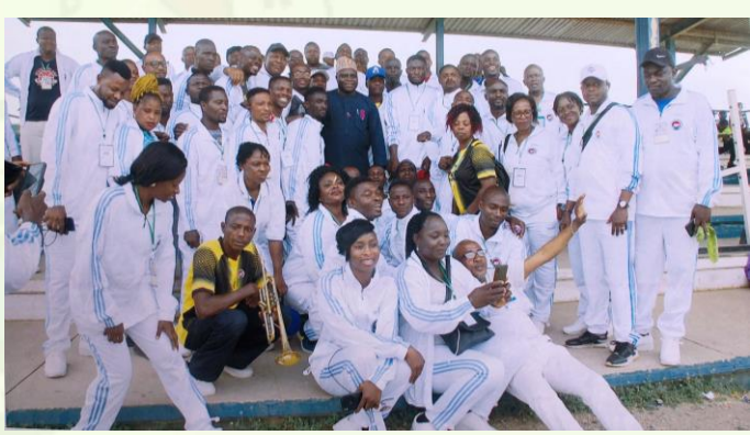
The ED and the CRIN contingent at RIGAN