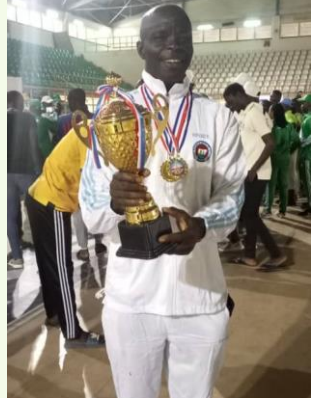
Display of the two gold medals won by CRIN