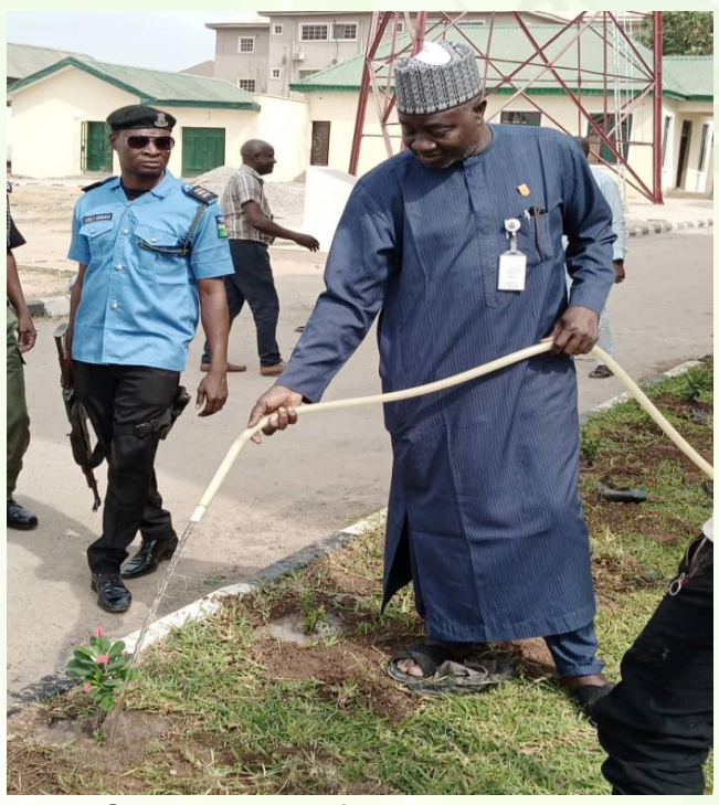
The ES watering the flowers