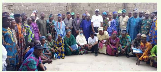
Cross section of the participants at the training

practices like sun-drying cocoa produce along the road and using wrong chemicals."