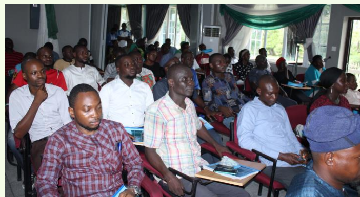
Cross section of participants at the sessions