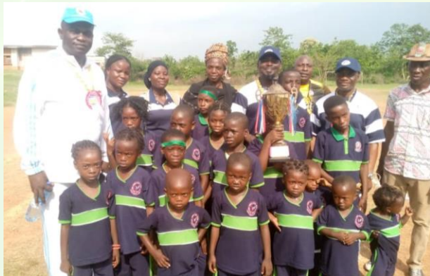
SSAUTHRIAL members with the winning team

A MONTHLY PUBLICATION OF COCOA RESEARCH INSTITUTE OF NIGERIA (CRIN), IBADAN.