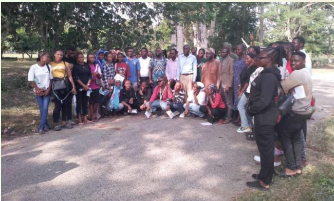
Staff and Students from Osun State University

Also, on the 24th of May, 2023, thirty-one (31) students from Ijebu North Anglican Model College, Aparaki, Oru-Ijebu, Ogun State visited the Institute on excursion. The visitors were received at the exhibition room of the Institute.