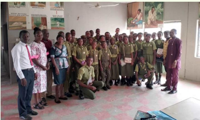
Staff and Students from Ijebu North Anglican Model College