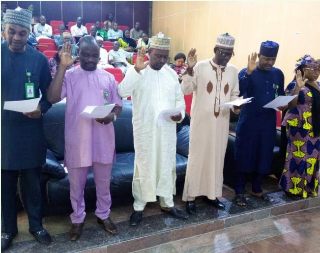
Swearing in ceremony of the ACTU Team