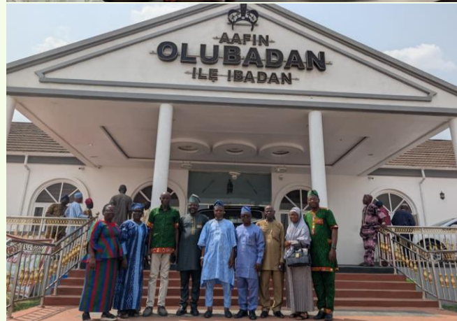
Oba Olubadan hosts CRIN Acting E.D. and Staff at his Palace