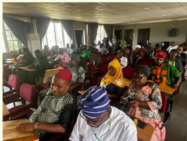
Some members of Staff during the promotion Exercise

Further details on results and next steps are expected to be communicated to examinees and the wider CRIN community in due course.