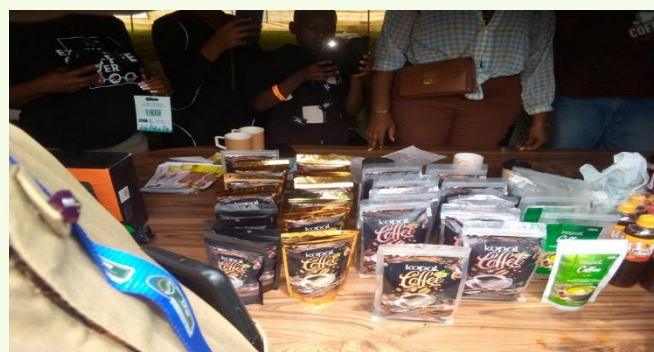
Coffee Products Exhibition at the Festival